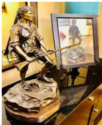
Sons of Liberty Statue

As a fundraiser FLSSAR is holding a drawing for a limited-edition bronze sculpture titled the "Sons of Liberty" (#10/50) crafted by world famous sculptor James N. Muir . Valued in excess of $6,000 , the drawing tickets are just $25 each or 5 for $100 . Mail a check to FLSSAR Statue c/o Palm Beach Chapter , PO Box 16735 West Palm Beach FL 33416.